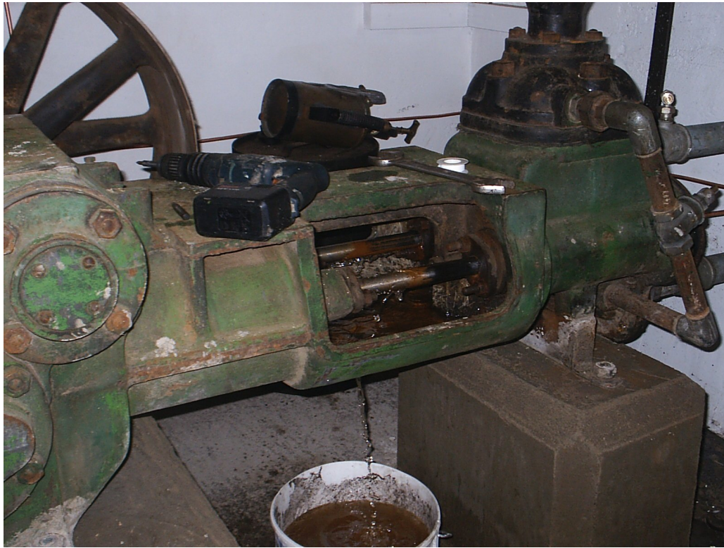
Pump installed in Crossley VO bay 2003