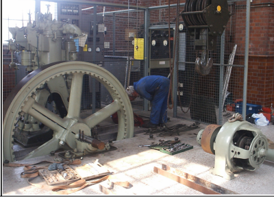
Start of dismantling at Somerford