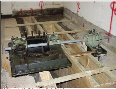
Bed with lower bearing bushes fitted and bottom section of vertical shaft.