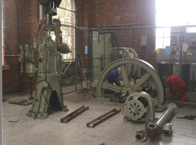
During dismantling at Somerford 2004