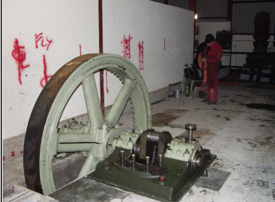
During dismantling at Somerford 2004