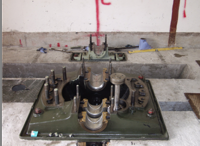
Centered and ready for assembly.